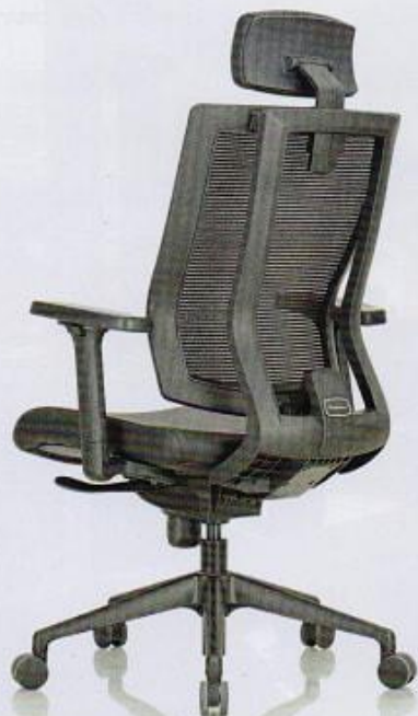
Liberate chair by Featherlite, designed with the new DynaFlex system, offers unprecedented flexibility and freedom to the user.

introduced workstations that provide numerous options for different postures and purposes in a single area." Featherlite's exhaustive office furniture catalogue includes an extensive list of customisable chairs that cater to the needs of all shapes, sizes and purposes. Their latest brainchild, the Liberate chair comes with the new DynaFlex system that offers unprecedented flexibility and freedom to the user using a special lumbar support that synchronises perfectly with one's back in all positions of recline. Their range of products can be found in some of the largest corporate offices