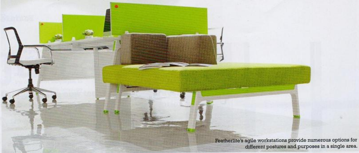
Featherlite's agile workstations provide numerous options for different postures and purposes in a single area.