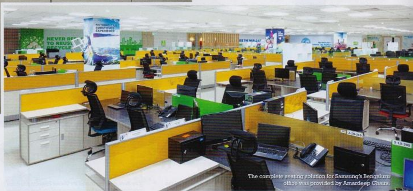
The complete seating solution for Samsung's Bengaluru office was provided by Amardeep Chairs.

When it comes to latest in seating systems in a workplace or office, it directs to a safe, comfortable and high-performance design, which synchronises with all functions of the user. Ergonomically flexible chairs give us the possibility to adjust the height, back support, seat tilt, depth, width and arm rests. Not only chairs,