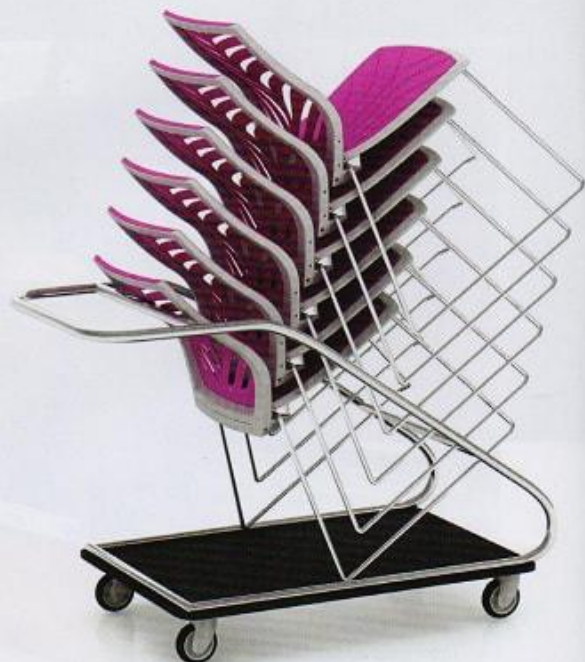
The Xera stacking model by Vector Projects provides practical solutions for cafeteria and conference areas.