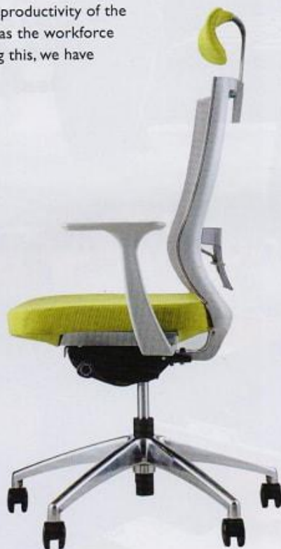
Vector Project's Xenic chairs conceptualised by keeping in mind the rules of bio-mimicry.